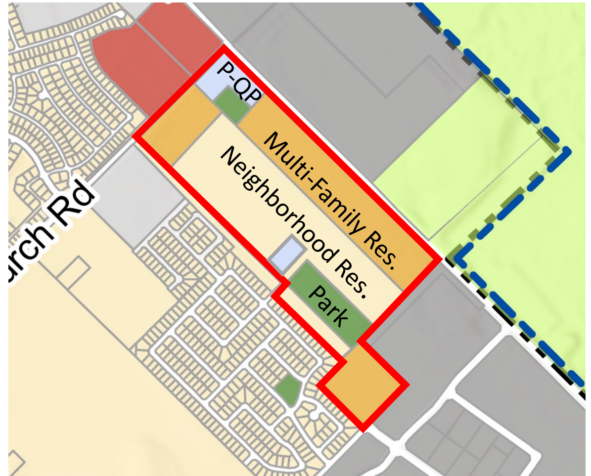
Proposed Land Use Plan