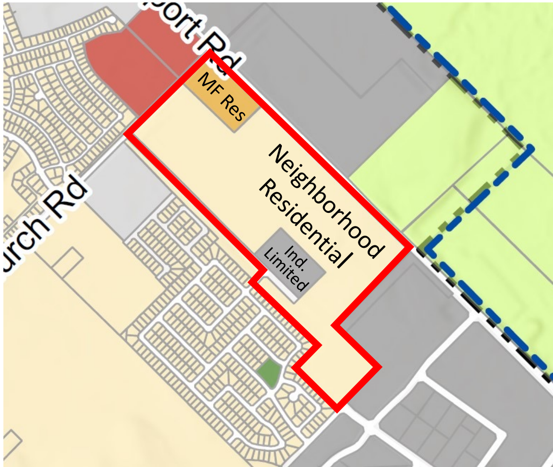
Current Draft Land Use Plan