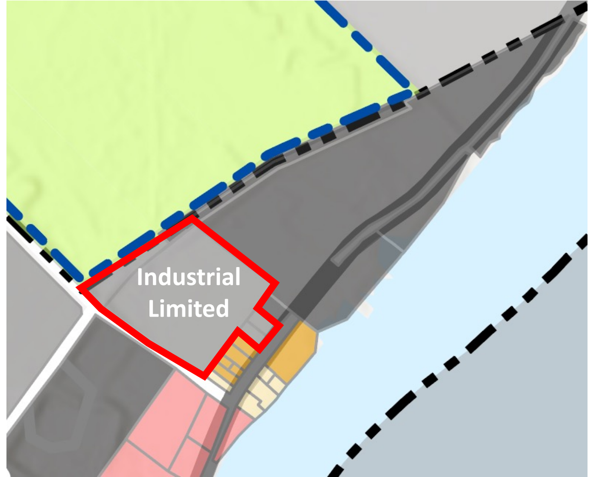
Proposed Land Use Plan